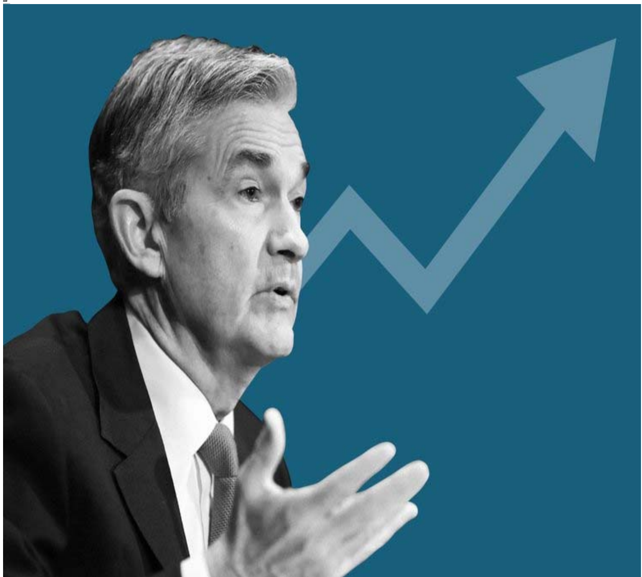
Fed Chairman Jerome Powell.